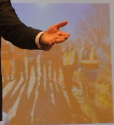
– Hurricane Fiona October 2022