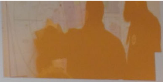
Bruce Power's Exercise Huron Endeavour October 2022