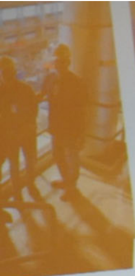
on Nuclear g Station er 2022