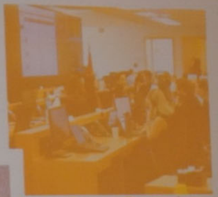
Bruce Power's Exercise Huron Endeavour October 2022