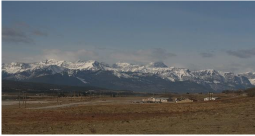
Mîni Thnî (Morley), AB